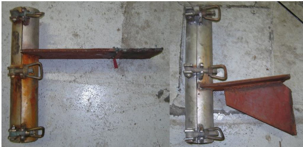
Clamp to be welded to the gunwale